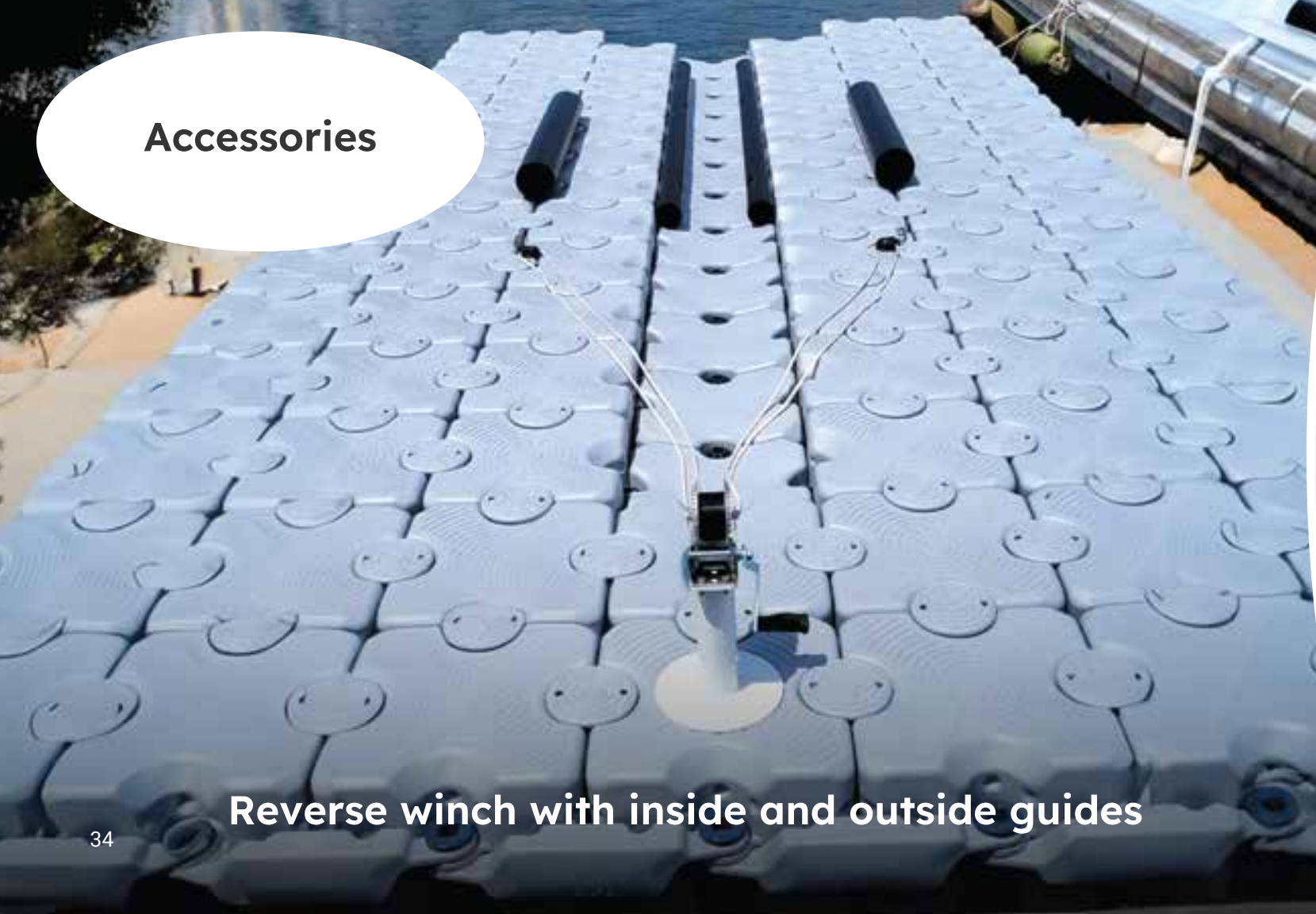
Reverse winch with inside and outside guides